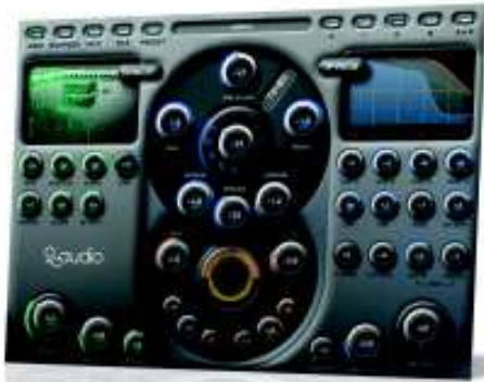
2CAudio PC MAC Aether $350