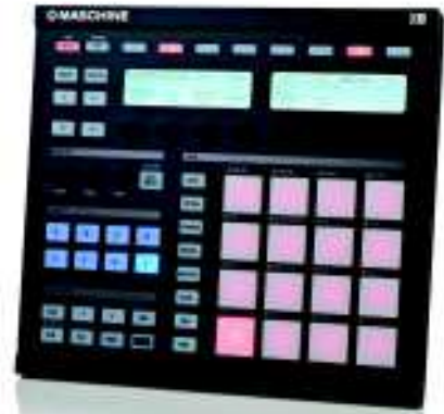
Native Instruments PC MAC Maschine €599

Verdict "u-he earned their soft synth stripes with Zebra, and the brilliant Uhbik pack gives them similar status in the world of effects"