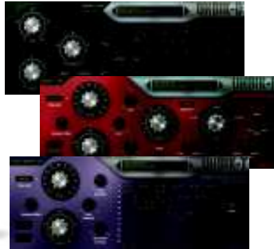
u-he PC MAC Uhbik $199

Verdict "One of the best algorithmic reverbs we've ever heard, although it may appear intimidating to the novice"