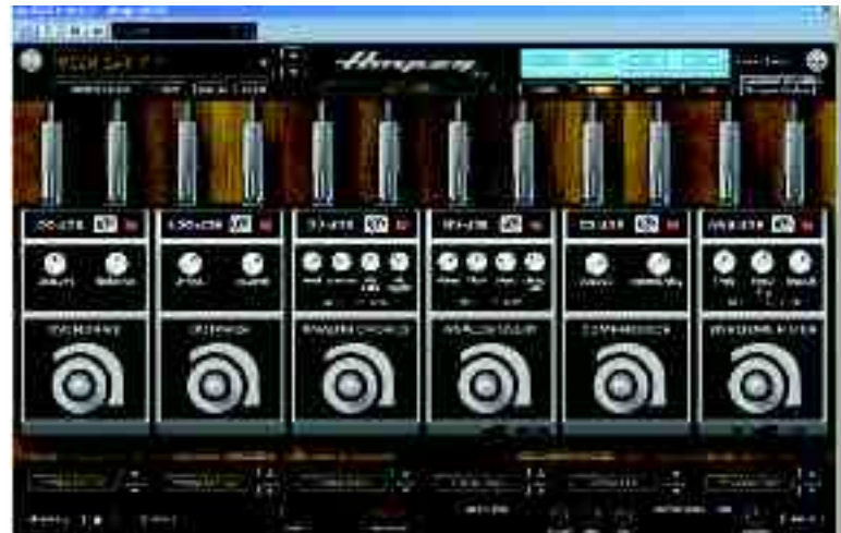
▲ Don't try this at home – it's more than most bassists could dream of

production teams may hit a pretty big problem when it comes to using Ampeg SVX: the limits of their own studio environment. The unfortunate truth is that the amplifiers and speaker cabinets modelled by Ampeg SVX are so good that they significantly outperform the limited bass capabilities of most people's monitoring systems.