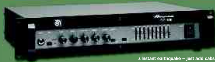
▲ Instant earthquake – just add cabs

Although the selection of amps and cabinets in Ampeg SVX isn't as wide as the roster that comes with AmpliTube 2, it still covers plenty of ground and enables you to create a wealth of classic bass tones.