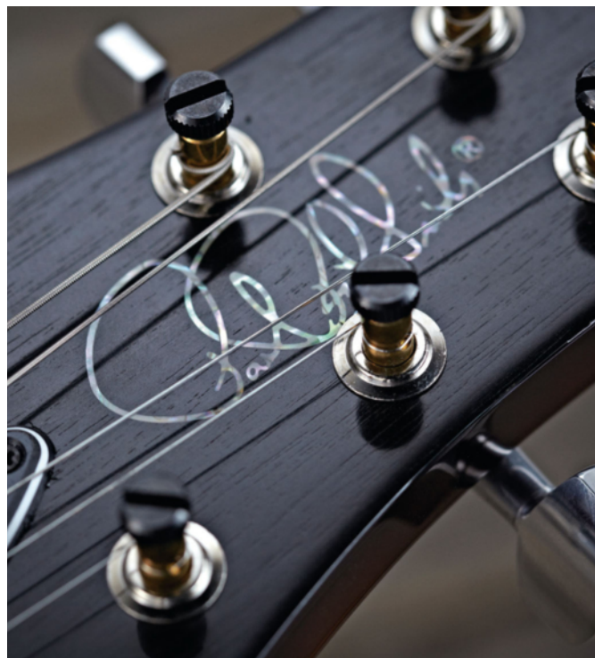
The PRS has the company’s proprietary locking tuners: quick string changes

The JA-15’s sounds have an acoustic-ness to them; they’re textured and very analogue, while the neck just disappears in your hand