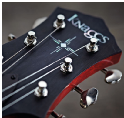
An understated headstock gives the Chena class

But it looks to the future in many ways – not least the construction. Like the PRS Hollowbody design (and indeed the JA-15, although the back is maple), the sides and inside carve of the back are cut from a solid one-piece slab of mahogany. The arched top is carved separately, then joined to the body to seal the form. Here, though, the back is thicker, which allows a rear belly cut, plus, viewed from the side, the whole thing tapers in thickness – it's thickest at the