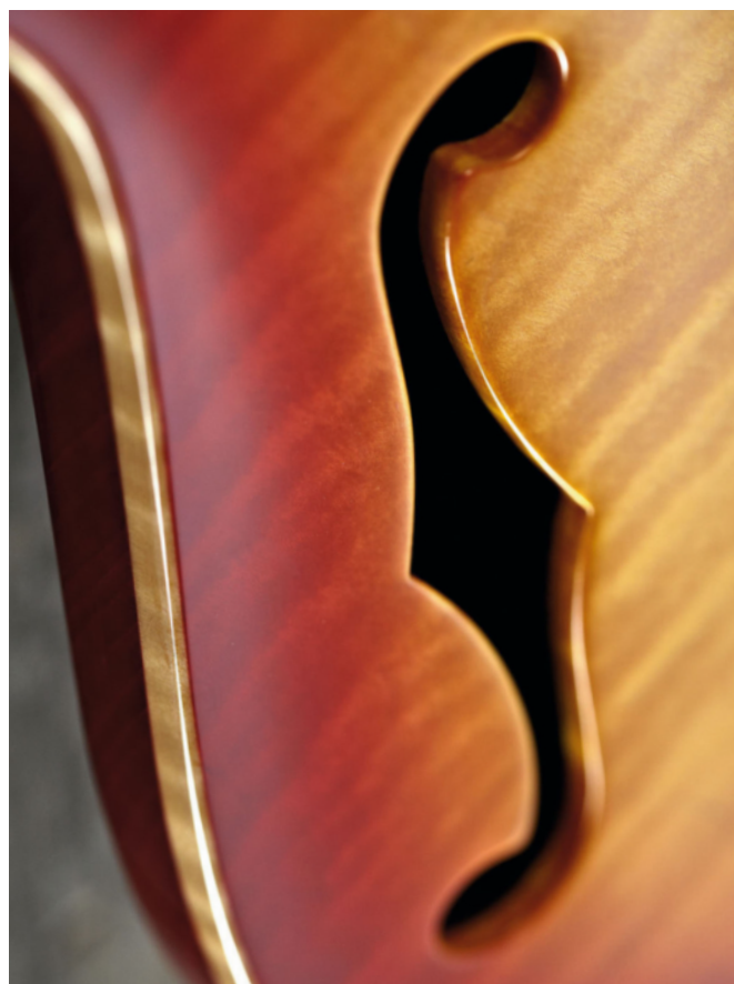
Visible grain contributes towards the Chena T3's beautifully aged finish

There's an old-Gibson-semi tonality to the Chena: that honky resonance, trim bass and clear but smooth high-end