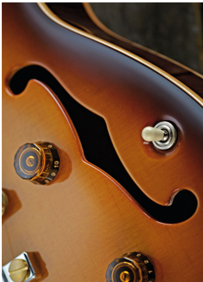
The JA-15 has a more traditional hollowbody archtop design than the Chena