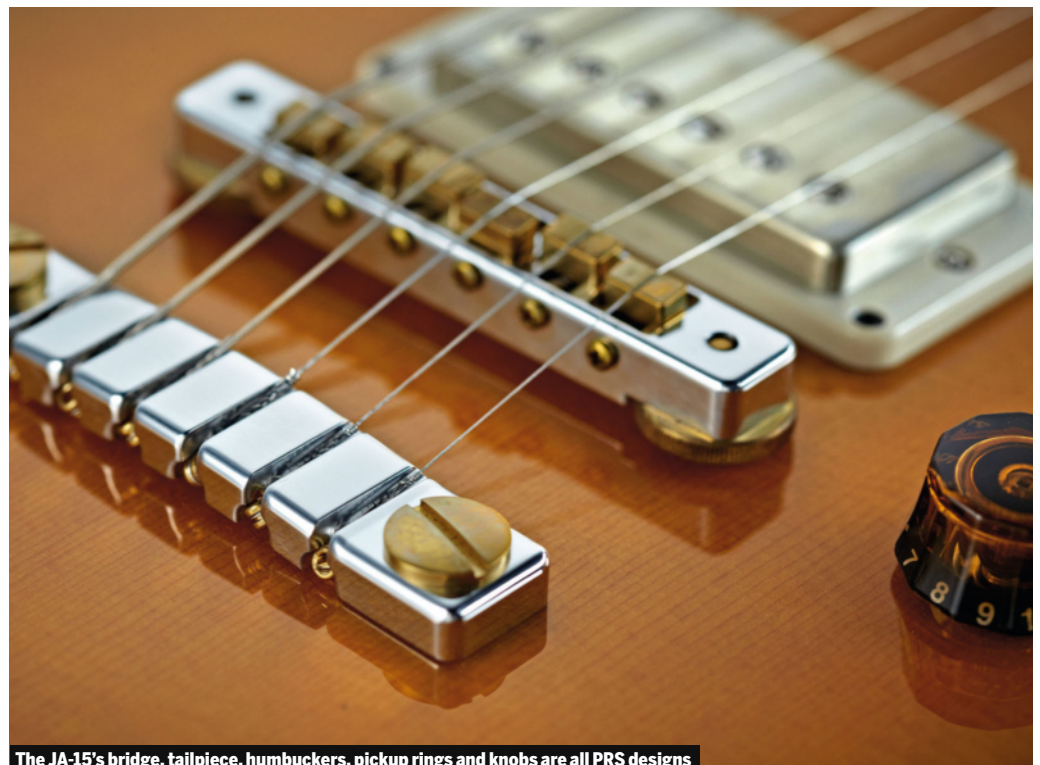
The JA-15's bridge, tailpiece, humbuckers, pickup rings and knobs are all PRS designs

Collings' single-cut SoCo Deluxe (from approx £5,200, also available in a large laminate 16LC version) is a 381mm (15-inch) centre-blocked semi, with solid maple top and mahogany back and sides. Fret King's Black Label Elise (£749) is a 368mm-wide (14.5 inches) semi, a downsized offset ES-335-alike – a superb choice if you're on a budget