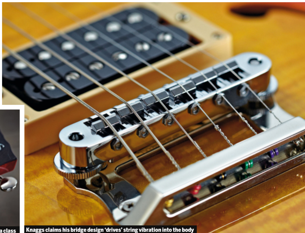
Knaggs claims his bridge design 'drives' string vibration into the body