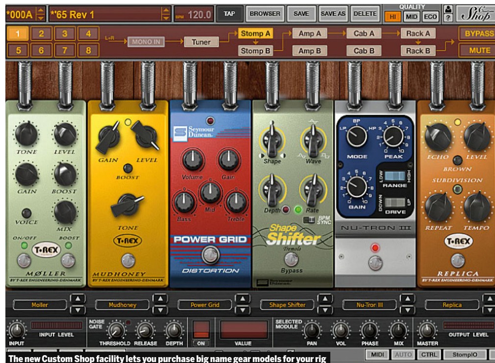
The new Custom Shop facility lets you purchase big name gear models for your rig

The main innovation with the version 3.5 update however, is the launch of the AmpliTube Custom Shop, directly accessible within AmpliTube using an online connection and offering individual gear models for purchase. Existing users of AmpliTube can go to the Custom Shop and add new models to their existing rig but, as an alternative to buying the