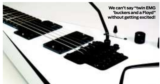
We can't say "twin EMG 'buckers and a Floyd" without getting excited!