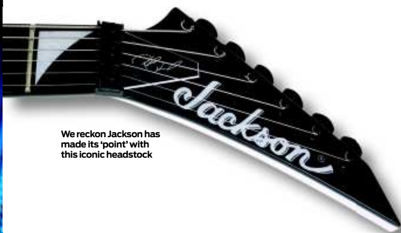
We reckon Jackson has made its 'point' with this iconic headstock