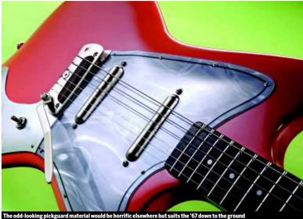
The odd-looking pickguard material would be horrific elsewhere but suits the '67 down to the ground

The '67 serves up sweet and atmospheric tones with a bell-like top-end and plummy mid-range