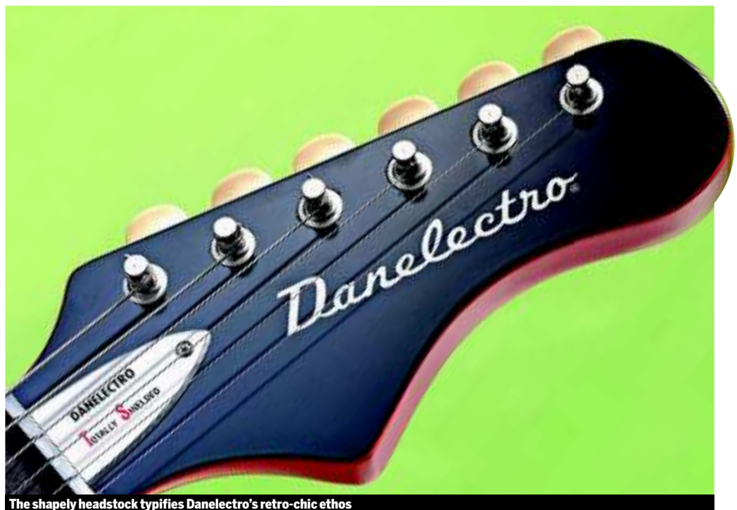
The shapely headstock typifies Danelectro's retro-chic ethos

Eastwood's Sidejack DLX (£309) is a Mosrite-inspired solidbody with Fender-style vibrato, roller bridge and dual P-90s. Fender's Classic Series '65 Mustang (£699) is more expensive, but retains that garage-rock look with two single-coils and Fender's 'Dynamic' vibrato. And don't forget the classic Danelectro DC59 (£229). No vibrato, but has dual lipstick tube single-coils and a heritage that includes a certain Mr J Page.