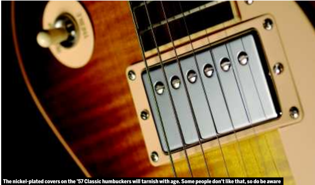
The nickel-plated covers on the '57 Classic humbuckers will tarnish with age. Some people don't like that, so do be aware