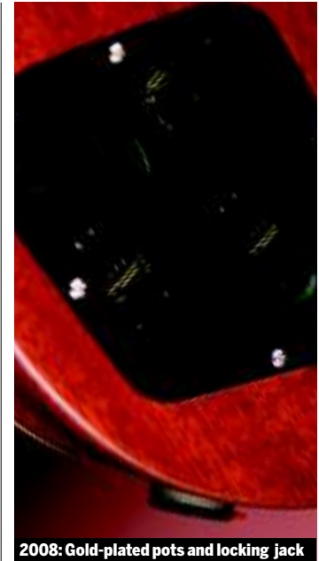
2008: Gold-plated pots and locking jack

We doubt any player will feel too short-changed though, not least because so many of us simply prefer an older-style nitro-cellulose finish and really aren't bothered by any mirror imperfections. A guitar is made to be played, right?