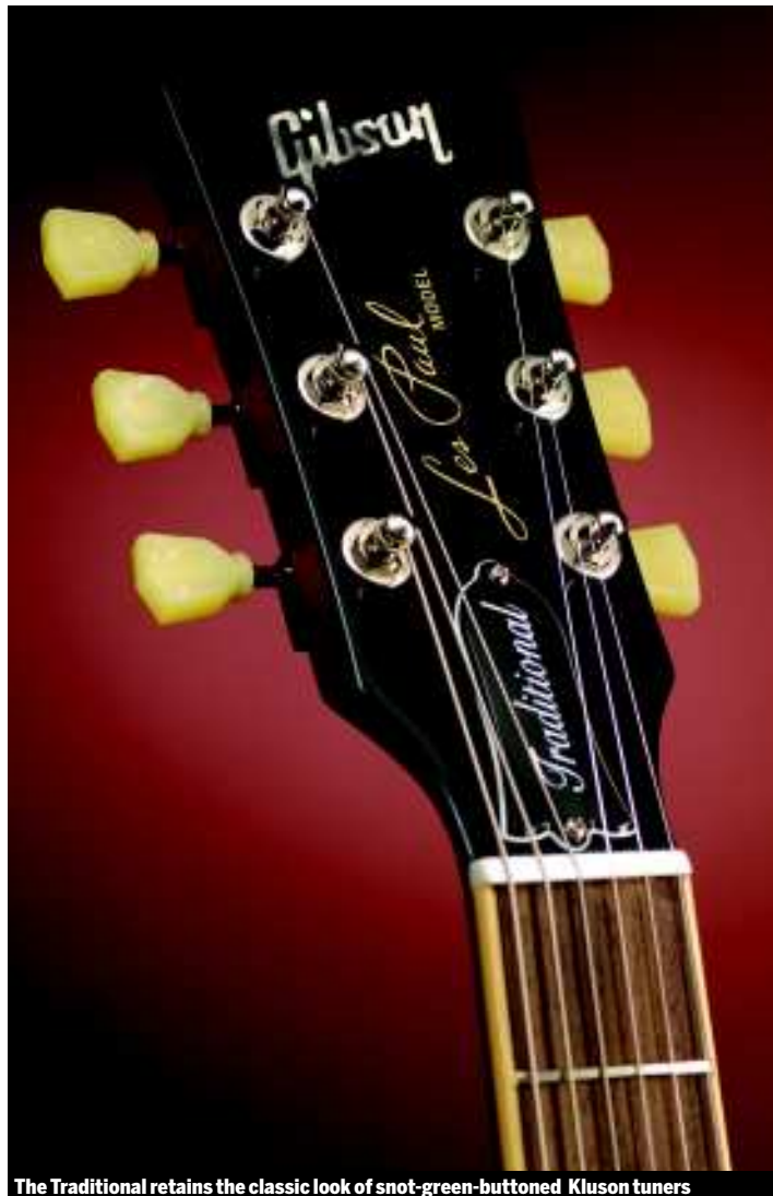
The Traditional retains the classic look of snot-green-buttoned Kluson tuners

The same goes for the nitro-cellulose finishing, which although it avoids the mirror-like dipped in glass sheen of, say, PRS, is still high-glossed. In various places though, such as the back and headstock edges, it is far from flat. Again, it looks so much sharper and less 'can't be bothered' than so many production 'Pauls of recent years.