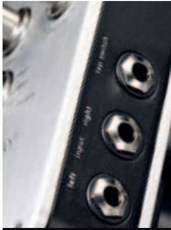
All AFX pedals feature stereo inputs

to create eighth, dotted eighth or quarter notes automatically.