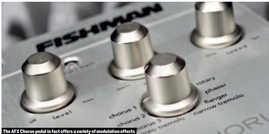
The AFX Chorus pedal in fact offers a variety of modulation effects

The effected sound is added in parallel with the direct sound proportionally so it can be used subtly