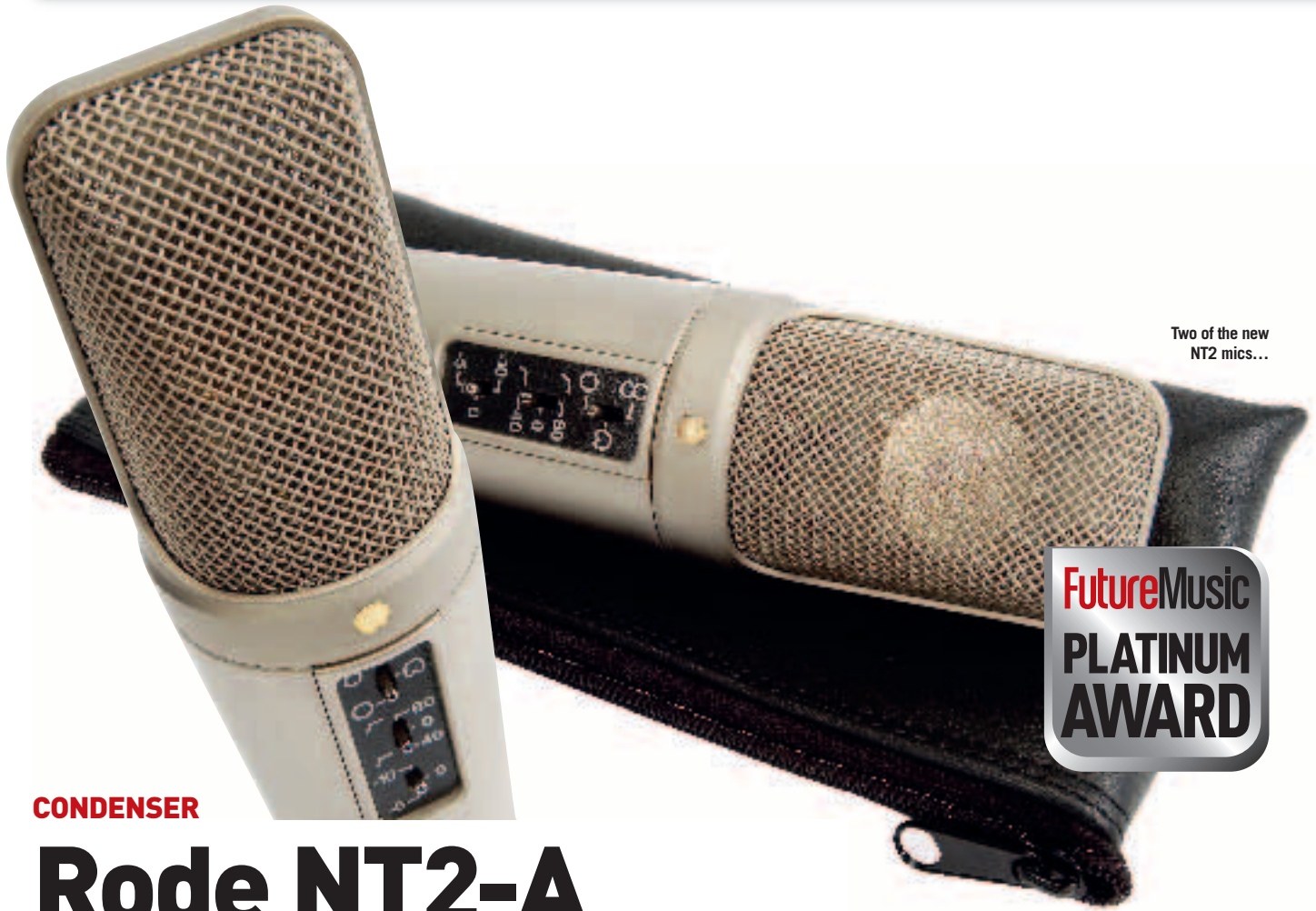
Two of the new NT2 mics...